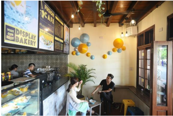
Fusion Café Hoi An

Begin your final day with a leisurely breakfast, as your flight departs at 6:25 PM you will be able to enjoy some sightseeing in the morning followed by a relaxing final spa treatment before being escorted to your flight back home.