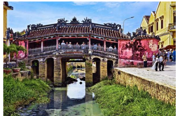
Japanese Covered Bridge

You may transfer back to the hotel or if you would like to do some sightseeing on your own there is much to see within walking distance from Favorite Café such as the Japanese Covered Bridge , famous for being an icon of Hoi An (05 mins by walk). Other points of interest include Phuoc Kien Assembly Hall and Tan Ky House where the beautifully preserved interior depicts a crab shell shaped ceiling and inlaid mother of pearl poems.