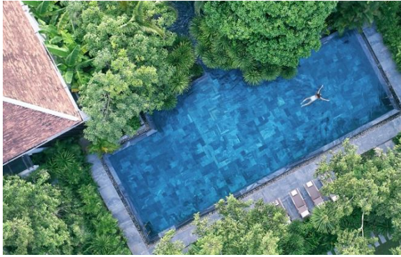
Fusion Maia Spa & Resort

Depart Hong Kong (HKG) by Hong Kong Express flight UO552 at 0940hrs, arrive Danang (DAD) 1040hrs, meet and greet.