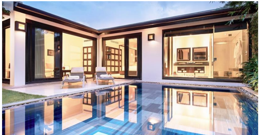
One Bedroom Pool Villa

Gentlemen's Facial – Male Skin tends to be thicker & exposed to more radicals, and shaving routines can damage the skin, the treatment for men replenishes the face with needed nutrients and prevents environment damage (for all types of skin).