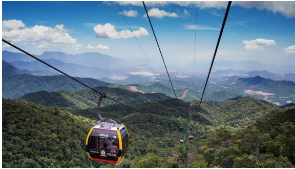
Ba Na Hills Cable Car

Enjoy breakfast in the comfort of your hotel.