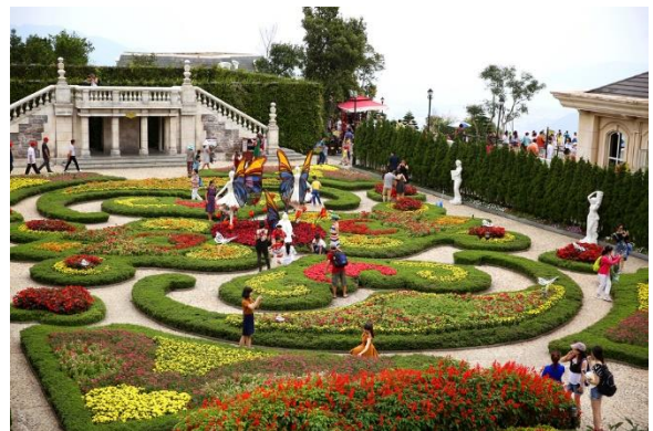
Le Jardin D'Amour Gardens

Continue to Le Jardin D'Amour Gardens where your private guide will help you discover the nine gardens of the area, the nine amusing tales and the nine varying architectures that harmonize together to form a beautiful visual sonata of beauty.